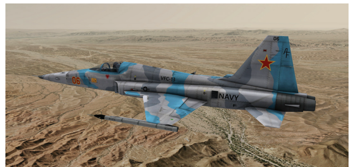
VRSG real-time rendering of an F-5N VFC-13.06 entity model in flight over MetaVR's terrain of Yuma Proving Ground, AZ. Terrain was built from 2 cm per-pixel resolution imagery captured by MetaVR's SUAS.

Edge blending and distortion correction support of third-party solutions from Scalable Display Technologies and VIOSO.